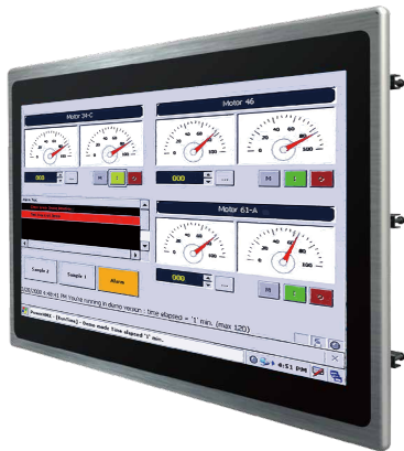
Real Flat Panel Mount (IP65 front side)