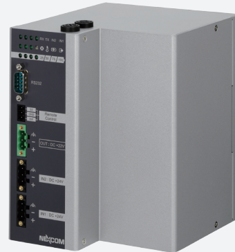
NISKBAT3 Power Pack