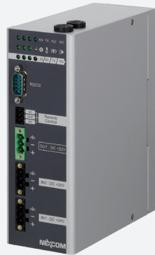
NISKBAT Power Pack

Din Rail Power Pack with Supercapacitors 24V DC Input, 22V DC Output