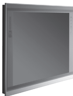
▲ Ultra-slim mechanism design