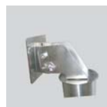
Head tube support in 316L stainless steel