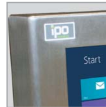
316L stainless steel IP66 six sides