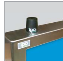
Wifi internal with rugged antenna