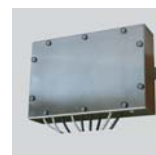
Plug box IP66 in 316L stainless steel