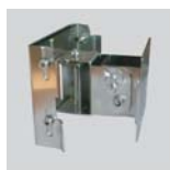
Wallmount support in 316L stainless steel