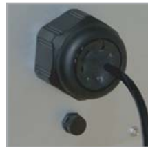
I/O trap protection with cable gland