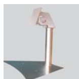
Stand mount support in 316L stainless steel