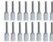
Wire Terminal * 16